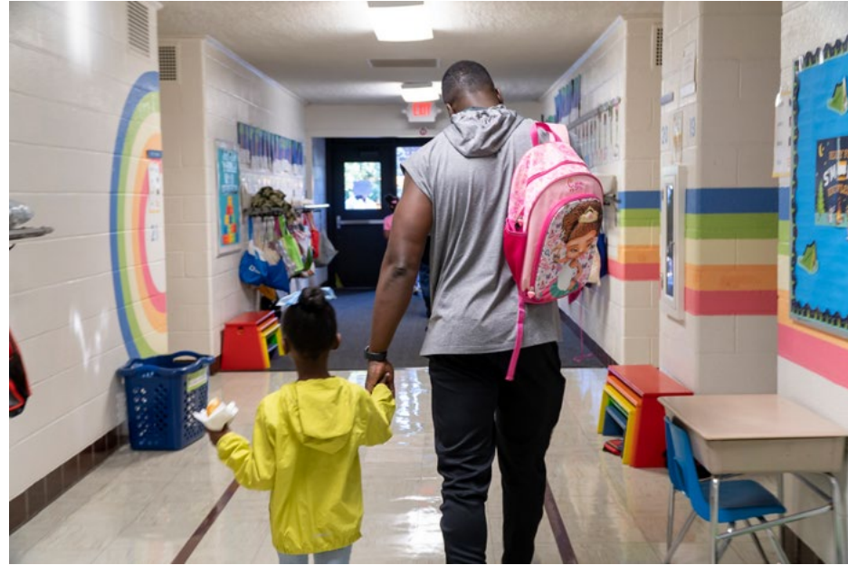
Photo Caption: Over 20,000 men participated in our Walk Your Child to School event in September, one of several initiatives designed to strengthen bonds between fathers and families. Fathers, step-fathers, grandfathers and father-figures made the walk and the pledge to instill the value of learning in their children and help them achieve the best possible outcomes in the classroom.

Our Fatherhood Initiative reaches fathers through a 24-hour helpline, a new father boot camp, skill building, job training, premature fatherhood prevention programs and more. In 2019, more than 6,000 fathers committed to making a positive change for themselves and their children by participating in these initiatives.